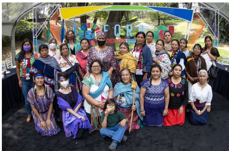
Indigenous women's groups performed at the opening ceremony at the Generation Equality Forum in Mexico.